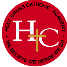
B Window Decal