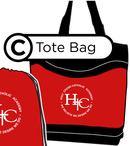
C Tote Bag